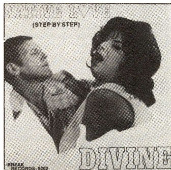
DIVINE "Native love"