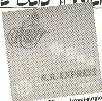
ROSE ROYCE 'R.R. Express' (maxi-single) WB 26.193