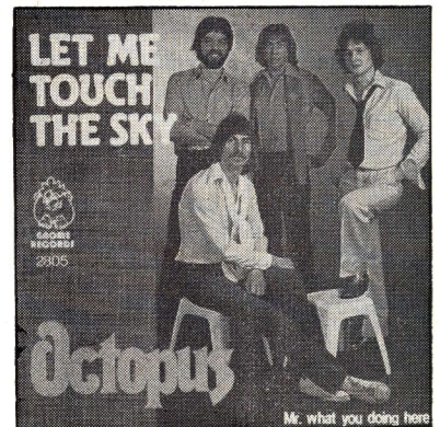
OCTOPUS Let me touch the sky Gnome 2805