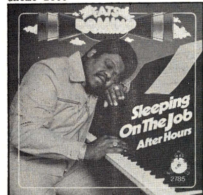
FATS DOMINO Sleeping on the job Killroy 2785