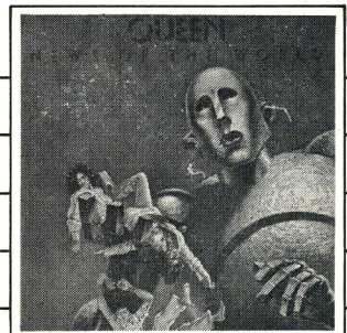
News of the World