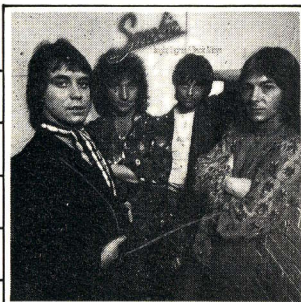
Bright Lights & Back Alleys