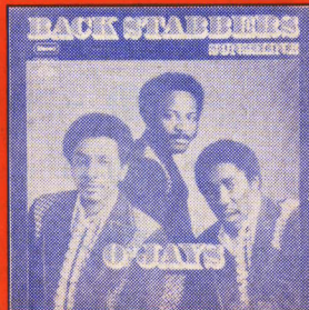
O'JAYS BACK STABBERS CBS 8270