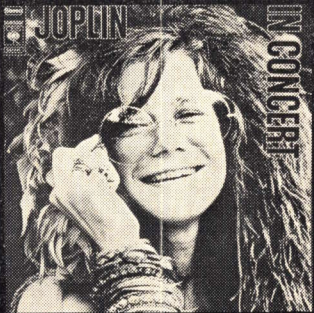
CBS S 67241 - f 29.50 dubbel-album met niet eerder verschenen Live opnamen!