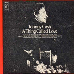
CBS S 64898 - f 21.- met o.a. A THING CALLED LOVE EN KATE